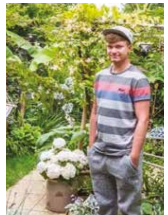
We could not do what we do without the hard work and loyalty of our wonderful garden owners who volunteer to open their gardens for the National Garden Scheme