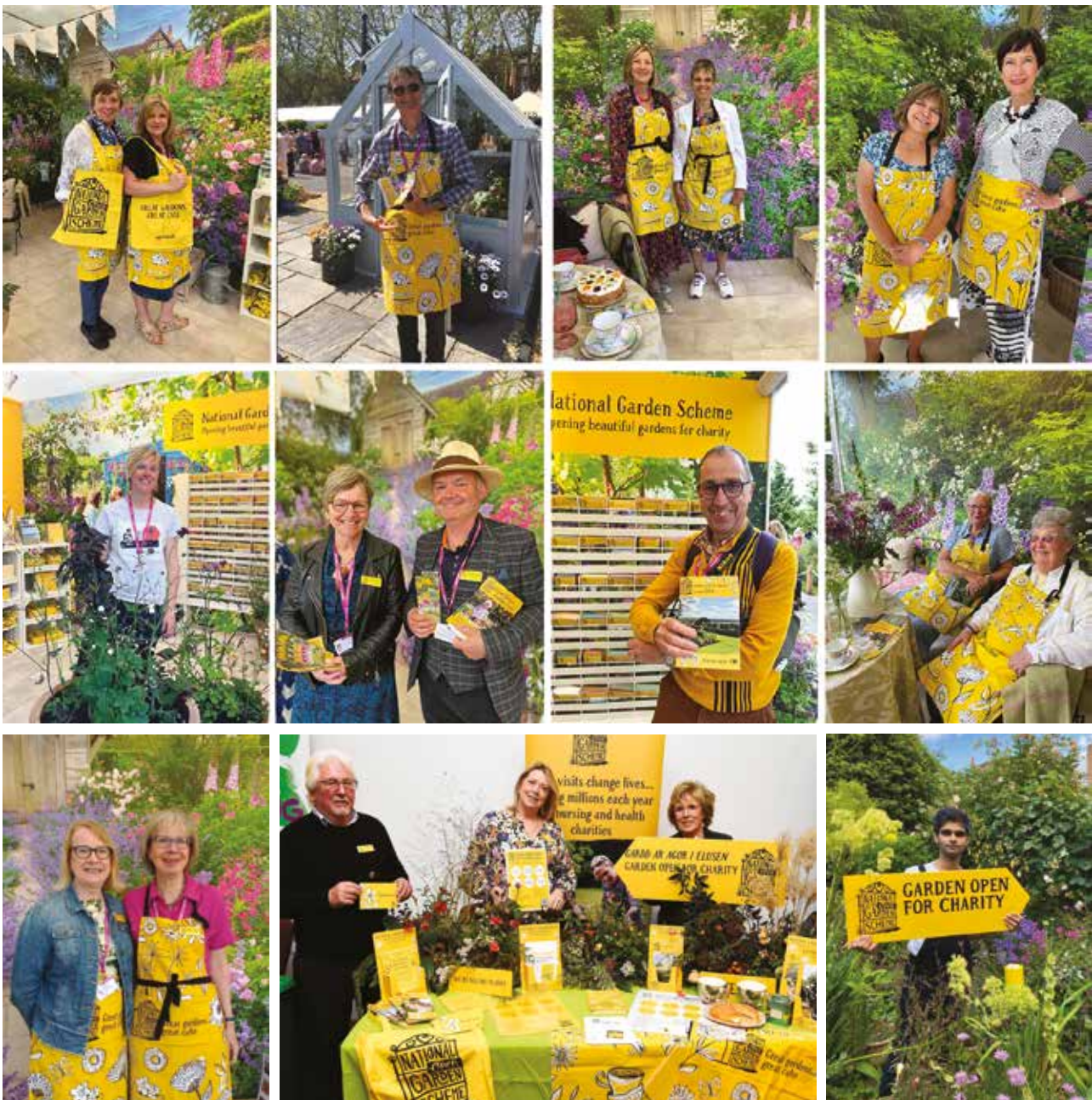
Just a few of the fabulous 585 volunteers who help us achieve so much for nursing and health charities every year