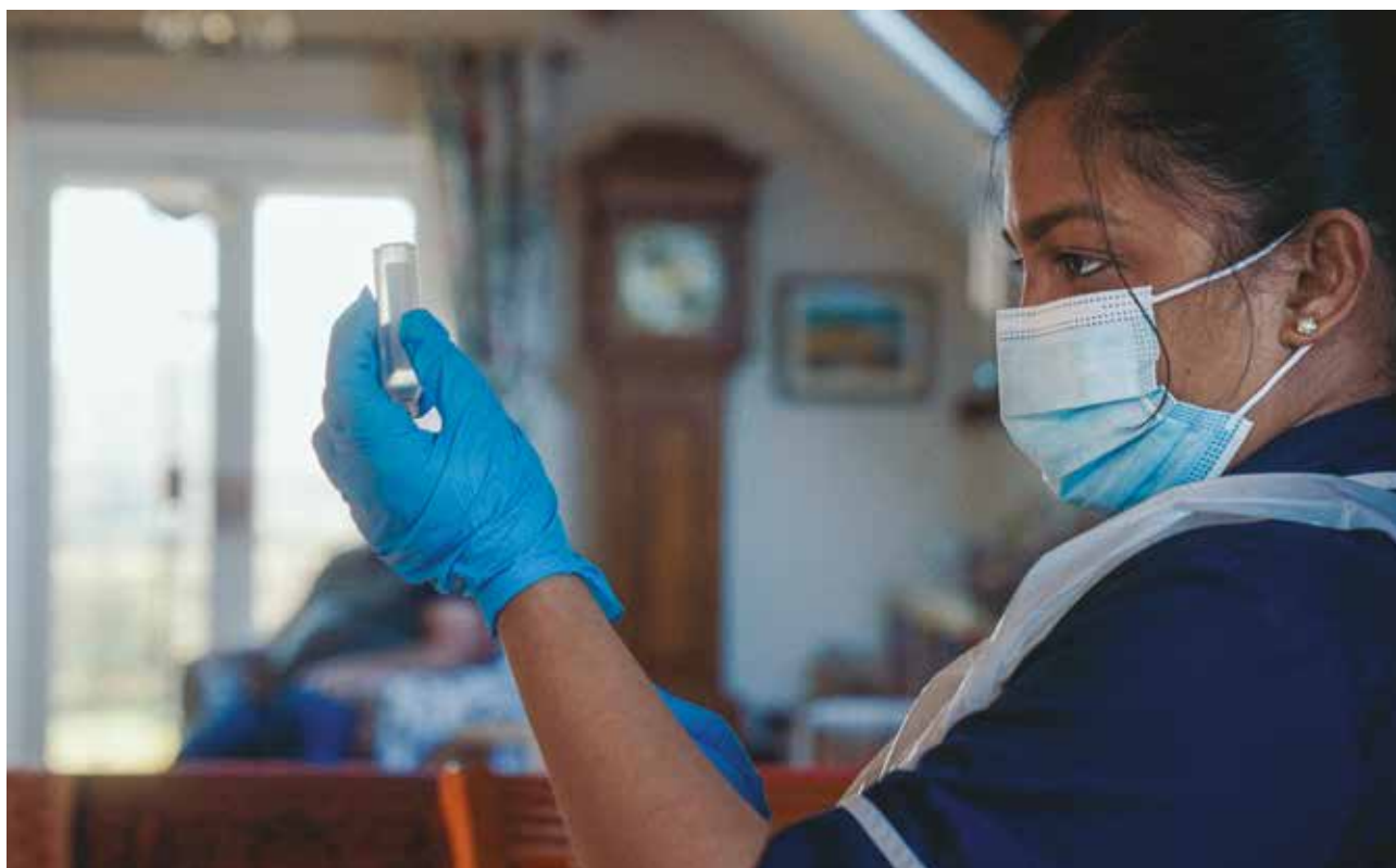
A Queen's Nurse at work

The National Garden Scheme was founded by The Queen's Nursing Institute (QNI) in 1927, when 609 gardens opened at a shilling a head. We became independent of the QNI in 1980 and the charity has remained a valued partner ever since with the National Garden Scheme donating more than £6 million over the charities' 96 years together.