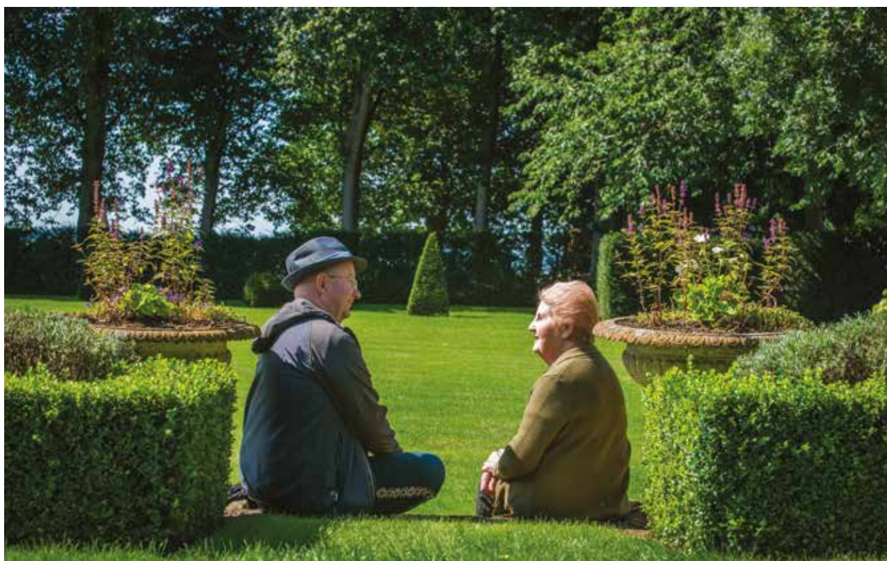
Carers enjoy a moment of tranquility on a visit to a National Garden Scheme garden

National Garden Scheme funding helped approximately 26,118 unpaid carers in 2023.