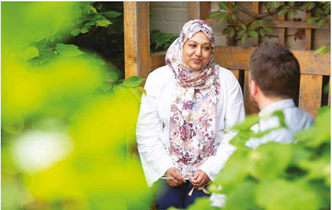
Maggie's Cheltenham