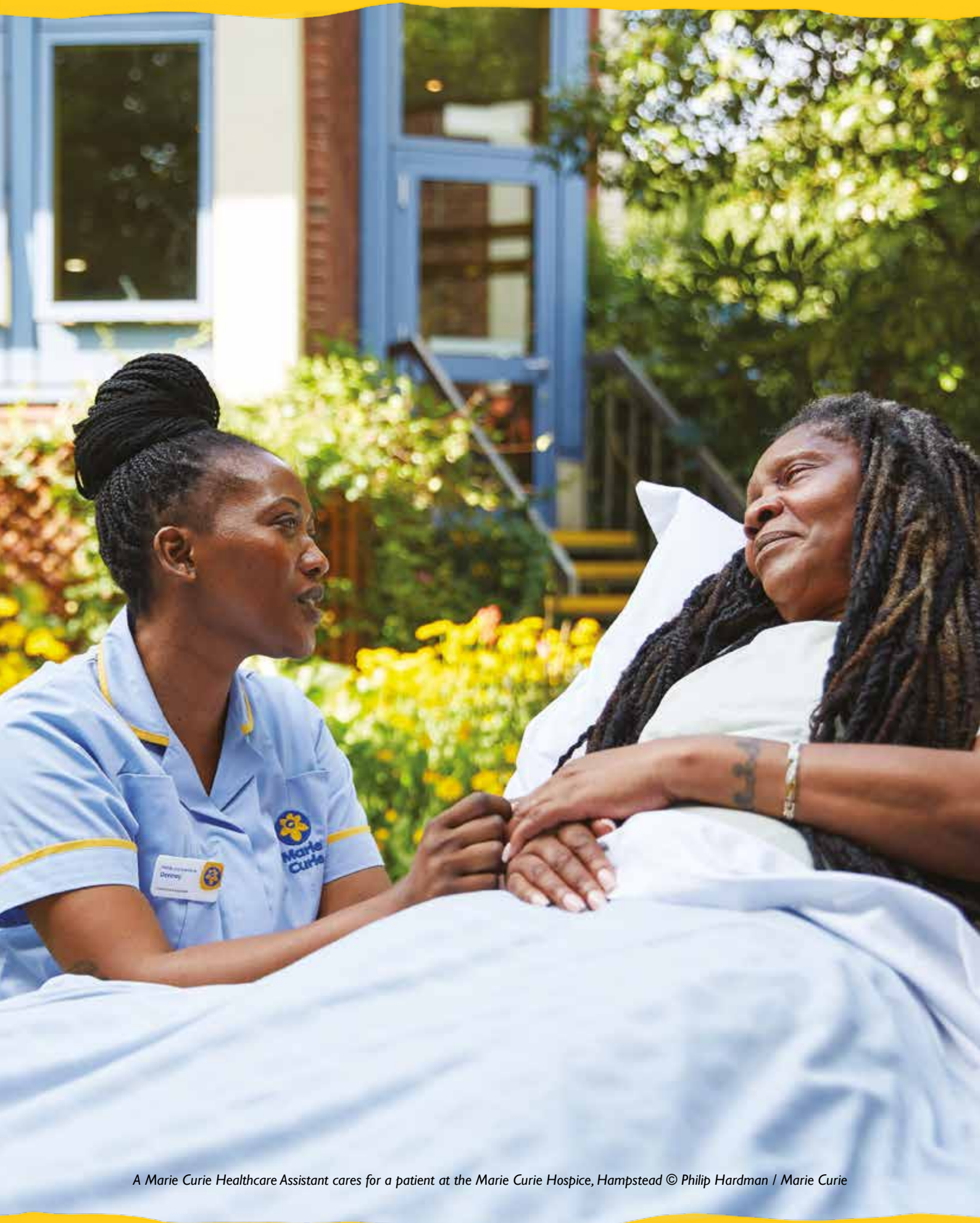
A Marie Curie Healthcare Assistant cares for a patient at the Marie Curie Hospice, Hampstead