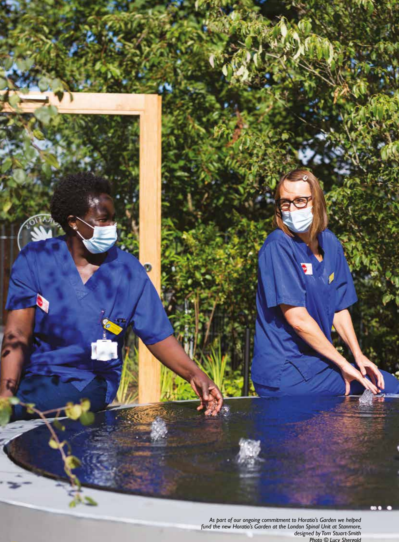
As part of our ongoing commitment to Horatio's Garden we helped fund the new Horatio's Garden at the London Spinal Unit at Stanmore, designed by Tom Stuart-Smith