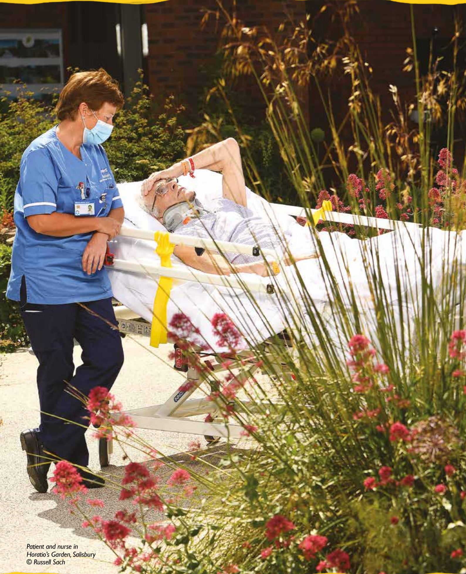
Patient and nurse in Horatio's Garden, Salisbury