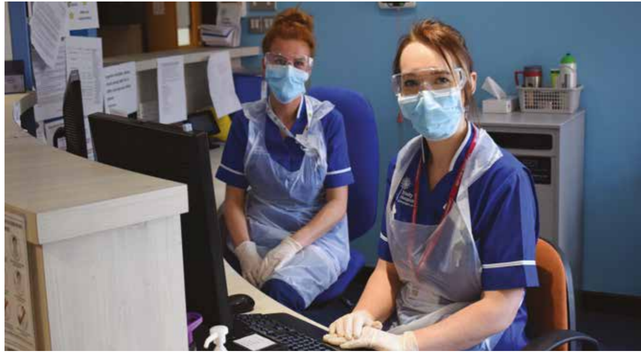
Hospice nurses in PPE at Trinity Hospice, Blackpool.

The National Garden Scheme has supported Hospice UK since 1996, donating over £5 million during that time. In 2020, the National Garden Scheme donated £425,000 - £250,000 in April and the remainder in November. This funding enabled the charity to continue supporting over 200 hospices in the UK who have been at the forefront of the battle against Covid-19, reducing pressure on the NHS by dealing with thousands of additional patients while continuing to care for people facing terminal and life shortening illnesses.