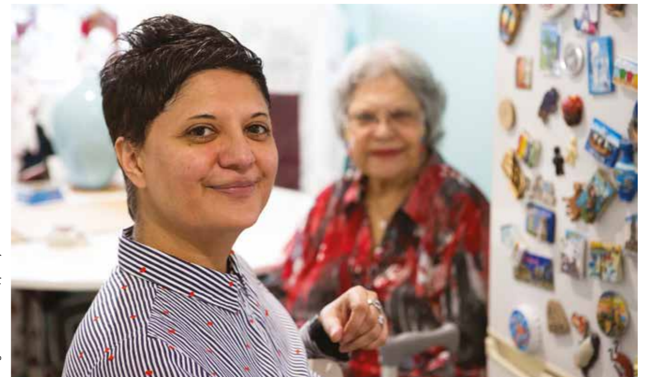
All library photos posed by models. Identities and photos of carers have been changed in the interest of privacy

In total, 2020 funding has helped support 18,130 unpaid carers across the UK.