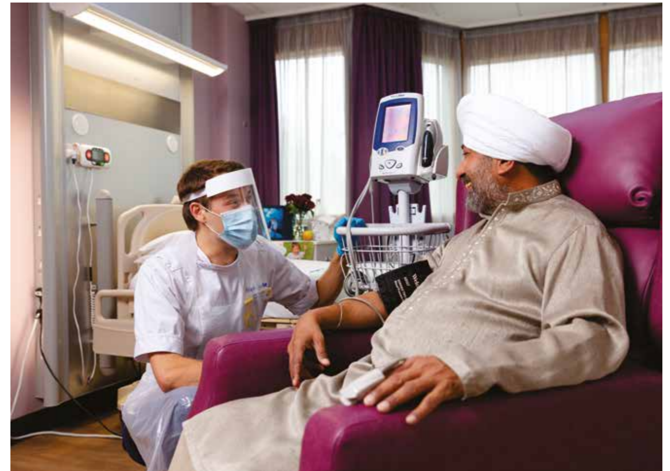
Full PPE as standard for the nursing staff at all Marie Curie Hospices during the pandemic

The National Garden Scheme has been supporting Marie Curie since 1996, donating over £9.5 million in that time, making us one of their highest-value partners. In 2020, the National Garden Scheme made a donation of £425,000 in November to help Marie Curie continue to provide their national end of life community nursing service, nine hospices, and information and support service and helpline.