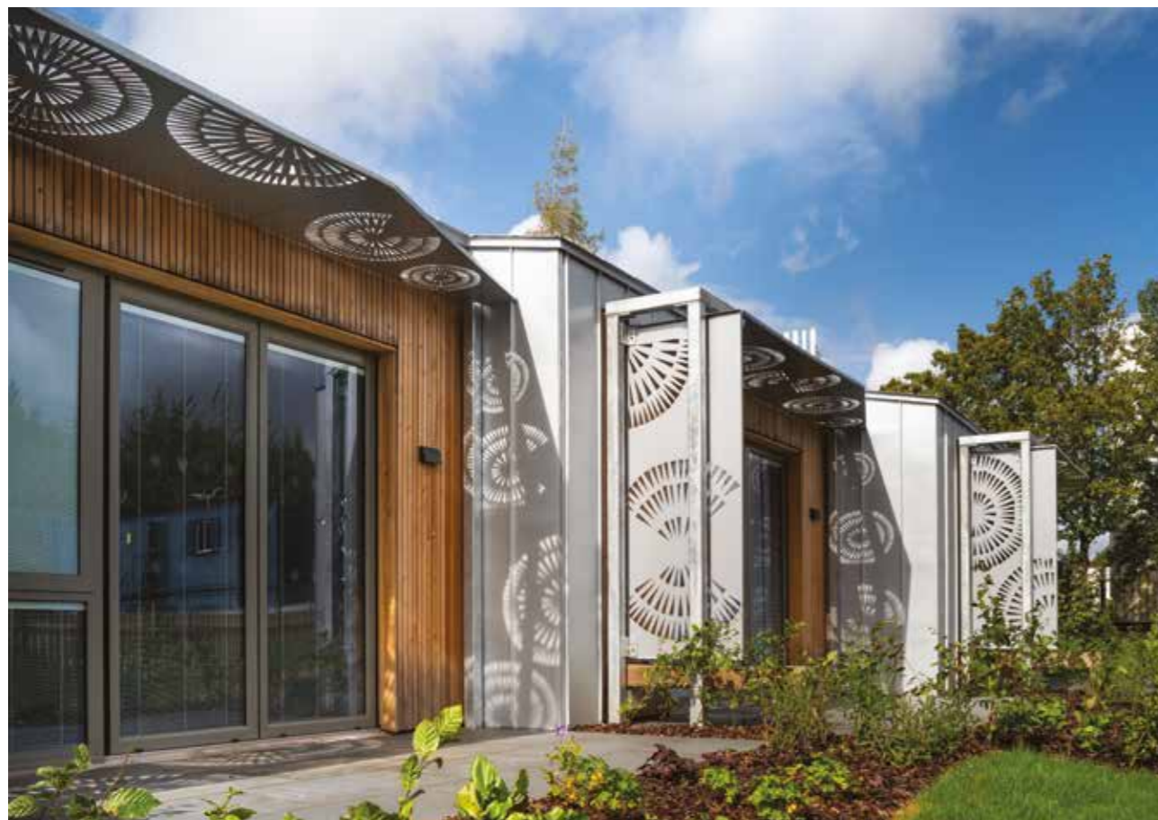
The purpose built rooms at Y Bwthyn NGS Macmillan Specialist Palliative Care Unit in the Royal Glamorgan Hospital, Wales with doors out to their own private garden space

Previous National Garden Scheme donations continue to support thousands at the NGS Macmillan Unit in Chesterfield and the NGS Wellbeing Centre in Bristol. In addition, the 150 Macmillan Nurses and other Macmillan professionals funded by the National Garden Scheme have enabled the charity to reach even more people and to provide the very best support from diagnosis on. In 2019, Macmillan reached 1,029,000 people affected by cancer through Macmillan Nurses, of which the majority - 947,000 - were people living with cancer.